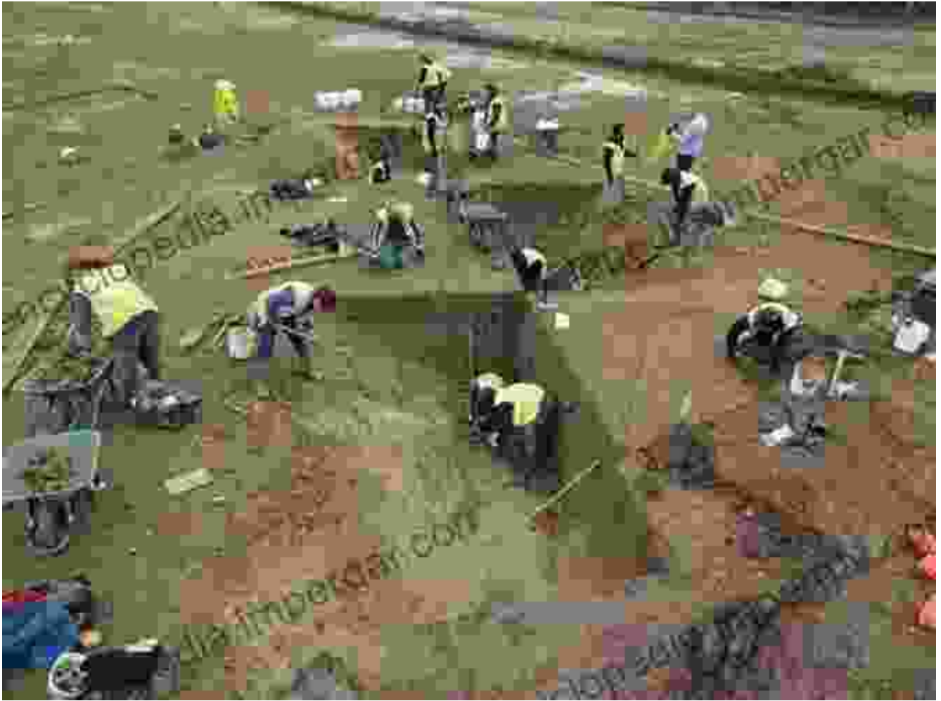
Image of an archaeological site being excavated