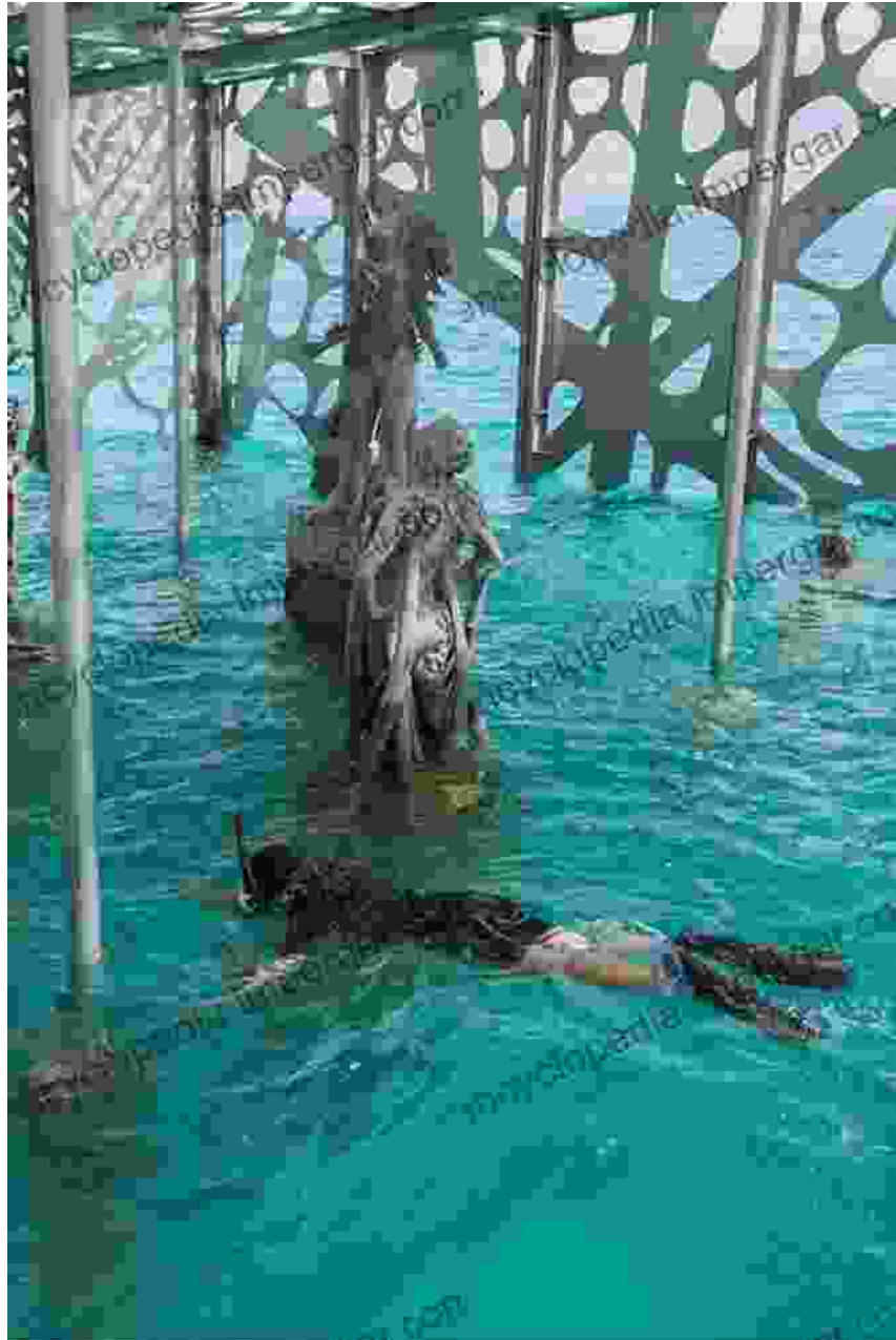
Image of underwater cultural heritage being conserved