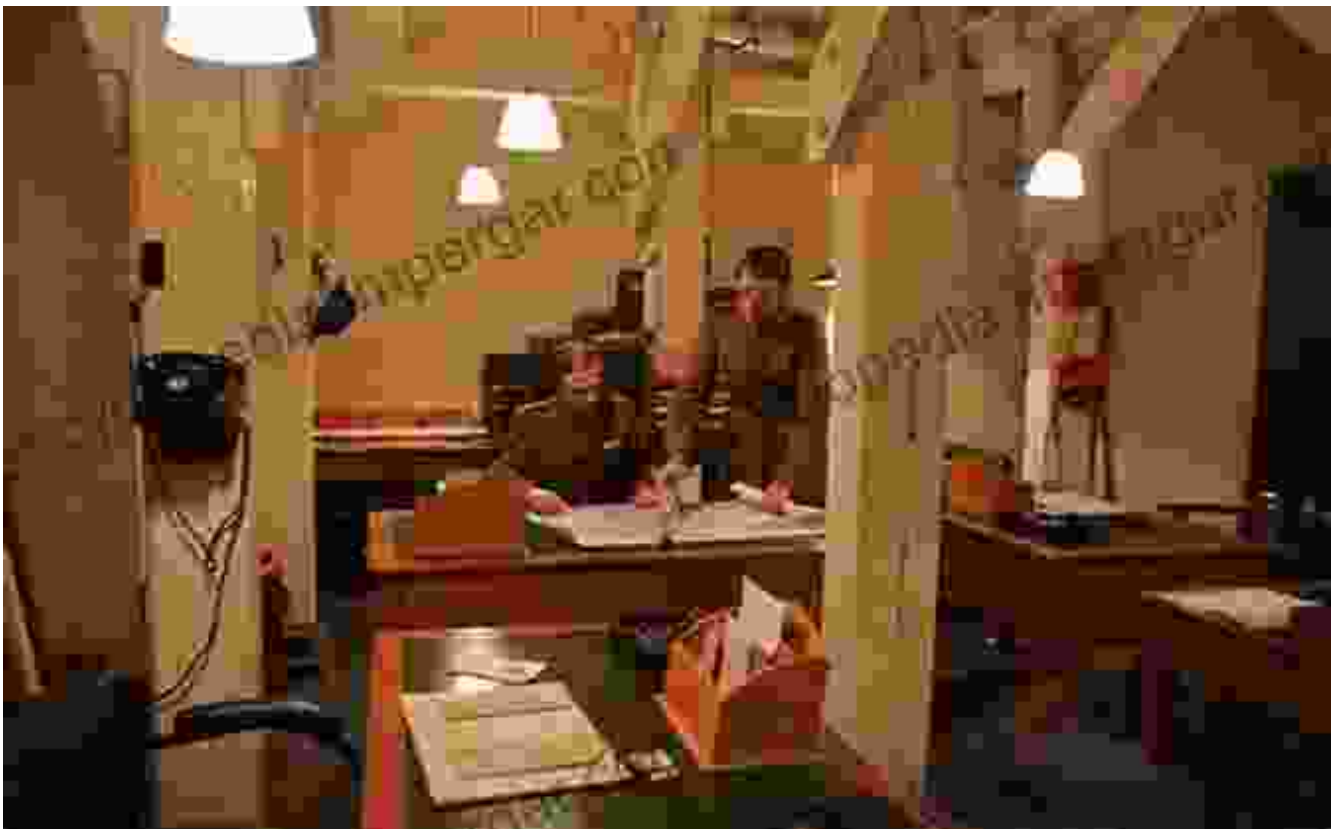
A Window into the Past and a Glimpse of the Future

The bunker's inhabitants would have been responsible for coordinating the nation's response to a nuclear attack, maintaining Free Download, and overseeing the rebuilding of society in the aftermath. The sheer scale and complexity of the bunker's facilities is a testament to the determination of the British government to ensure the continuity of governance, no matter how dire the circumstances.