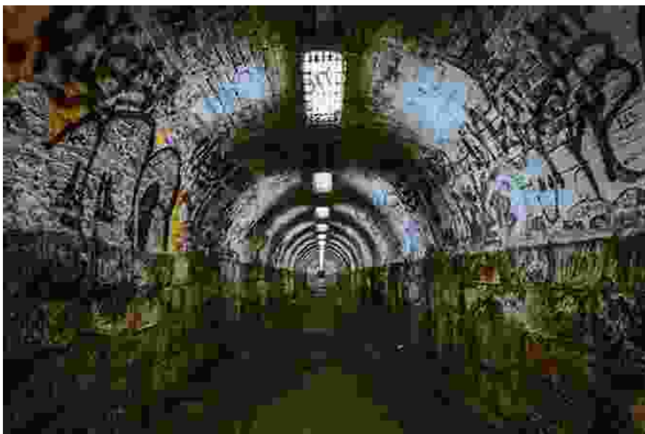
The Heart of National Resilience

In this subterranean realm, time seems to have stood still. The rooms are frozen in a mid-20th century aesthetic, with vintage computers, rotary phones, and maps of the world as they were at the height of the Cold War. It's as if the occupants simply vanished, leaving behind a haunting tableau of a world on the brink of annihilation.