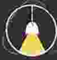
Point or Omni Lighting

Directional lighting is a type of lighting that comes from a single direction. It is often used to create strong shadows and highlights, and to emphasize the shape and form of an object.