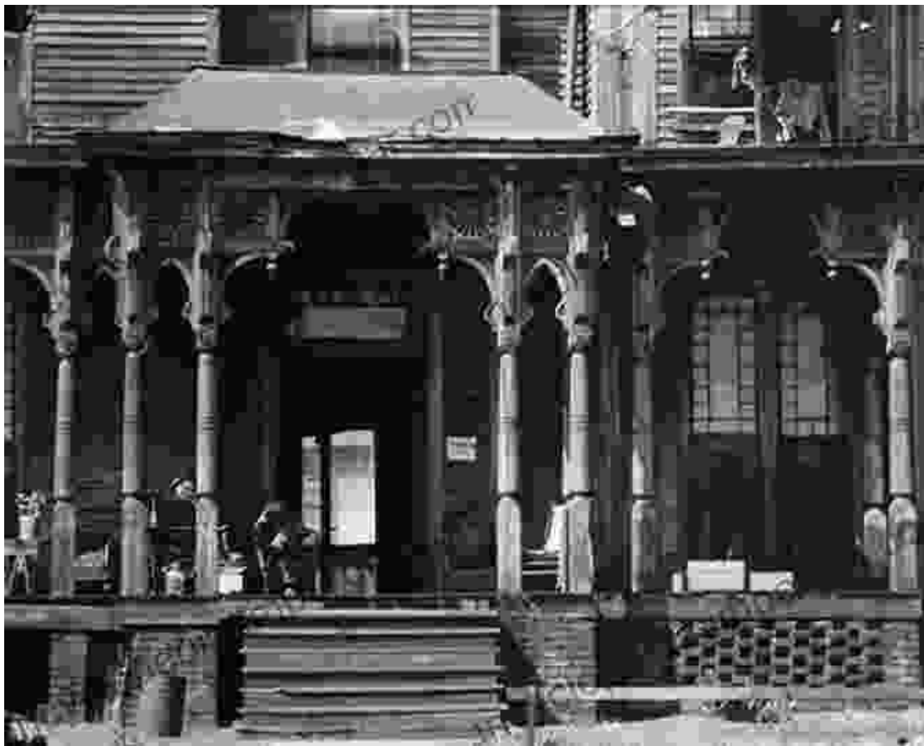
Walker Evans, Birmingham, Alabama, 1936.

chapter in its history. His images transcend time, providing insights into the struggles, dreams, and aspirations of urban dwellers during the Great Depression.